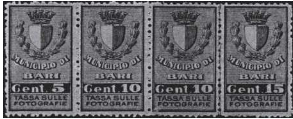
Black and white scan

From this point on, most of the gum is acceptable and does not stain the stamps.