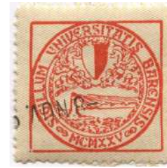
Earliest date 4/1953