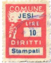
1 st Type

city, usage and value in dull blue Stampati 18.5 x 25.5 mm P11 10 Lire red 2.00