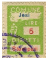
1 st Type

city in blue, usage and value in red Stampati 18.5 x 25.5 mm P11 5 Lire yellow green 2.00