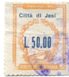
city and value in dull blue

value, vertical roulette and usage in black Segreteria 16 x 20 mm roulette 10 Lire pale red 3/1957 2.00