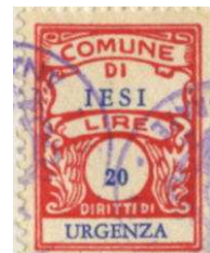
city, usage and value in dull blue

Urgenza 20 x 25 mm P11 10 L. orange 6/1965 3/69 2.00 20 L. gray green 3/1965 7/70 2.00